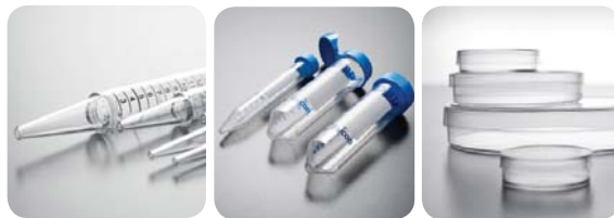
Free BD Falcon Express Pipet-Aid with minimum purchase