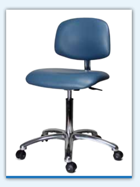
Cat. No. 14359970 - Desk Height SEAT HEIGHT: 19"-24"

Class 100 Clean Room chair, available in all standard colors.