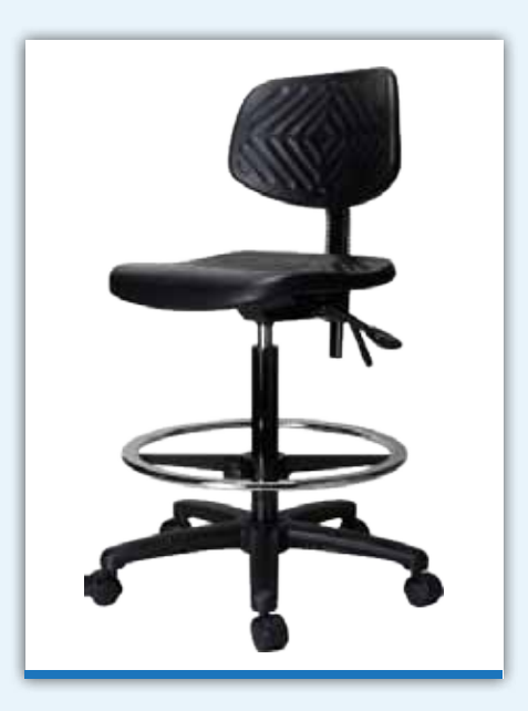
Cat. No. 14359838 - Bench Height SEAT HEIGHT: 19"-27"

Polyurethane chair with adjustable foot ring and casters.