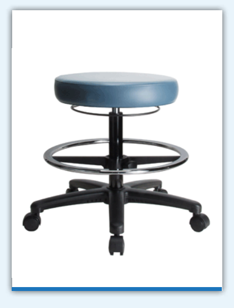
Cat. No. 14359401 - Bench Height SEAT HEIGHT: 21.5"-28"

Pneumatic upholstered stool with adjustable foot ring.