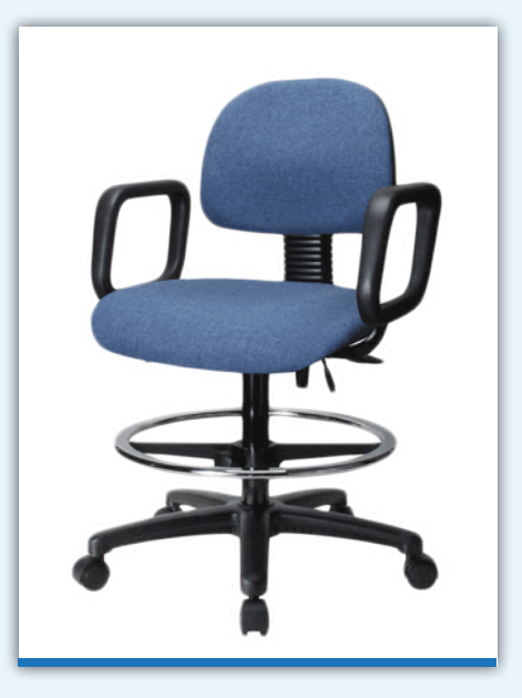
Cat. No. 14359509 - Bench Height SEAT HEIGHT: 21"-28"

Computer task chair with fabric upholstery. Shown with optional medium back, six-way adjustable armrests and chrome base.