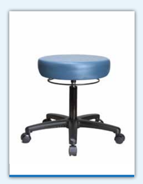
Cat. No. 14359409 - Desk Height SEAT HEIGHT: 18.5"-26"