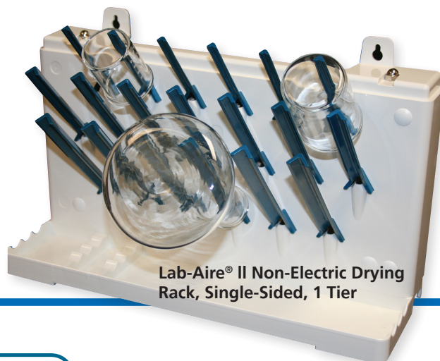
Lab-Aire® II Non-Electric Drying Rack, Single-Sided, 1 Tier