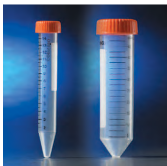
Corning® Centrifuge Tubes

Corning offers a full line of disposable, premium quality conical centrifuge tubes manufactured from high quality, ultra-clear resins. These tubes meet the quality and performance standards demanded by researchers.