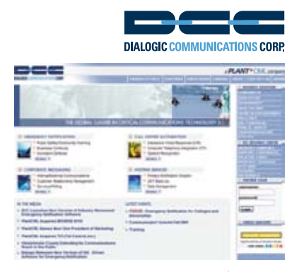
a PLANT * CIVIL company

For more information on how Fisher Safety can work with you to implement a DCC notification program at your campus, contact your Fisher Safety Representative or our Customer Service at (800) 722-6733.