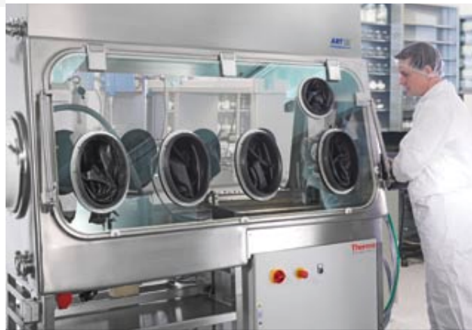
Place your process in a containment solution