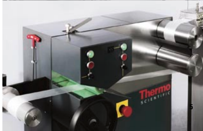
Accurate and continuous sheet and ribbon haul-off system